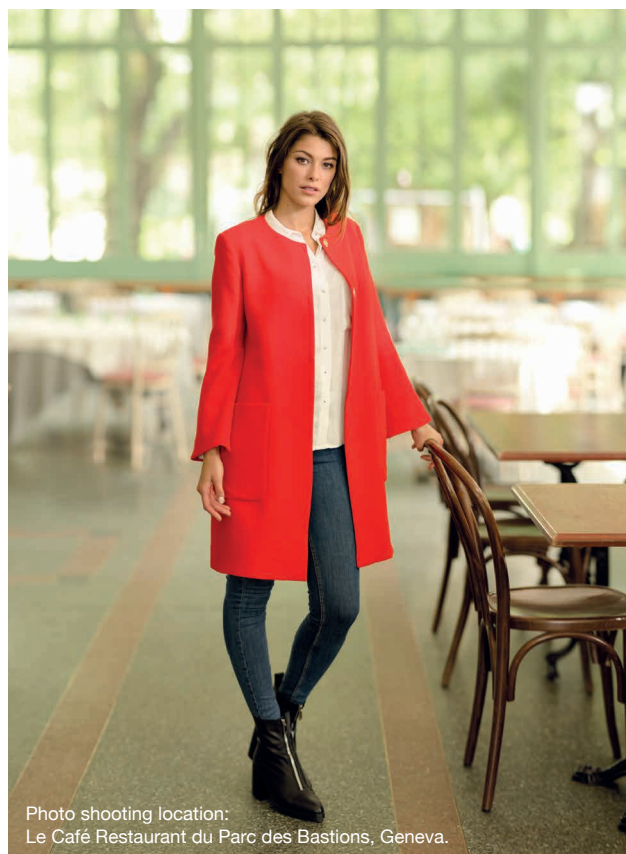
Photo shooting location: Le Café Restaurant du Parc des Bastions, Geneva.

No matter if decorative or functional, you will appreciate the precision and regular quality of all the stitches. The memory function of the 570α enables you to create personal and unique stitch combinations and to program text and names.